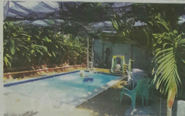
A view of the swimming pool for dogs.

ditioned room (for an extra RMI). Small and big dryers help in the drying process.