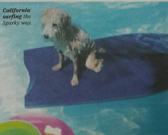
California surfing the Sparky way.