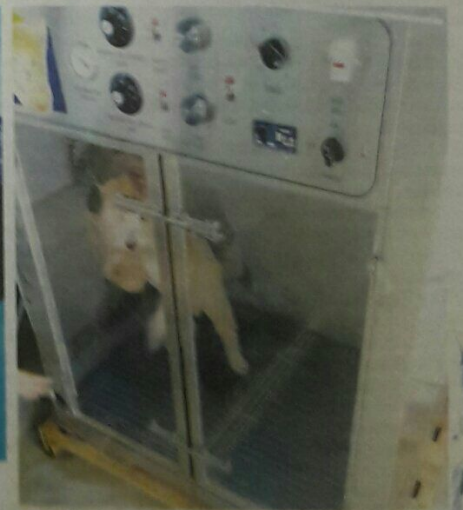
A drying machine for smaller dogs.