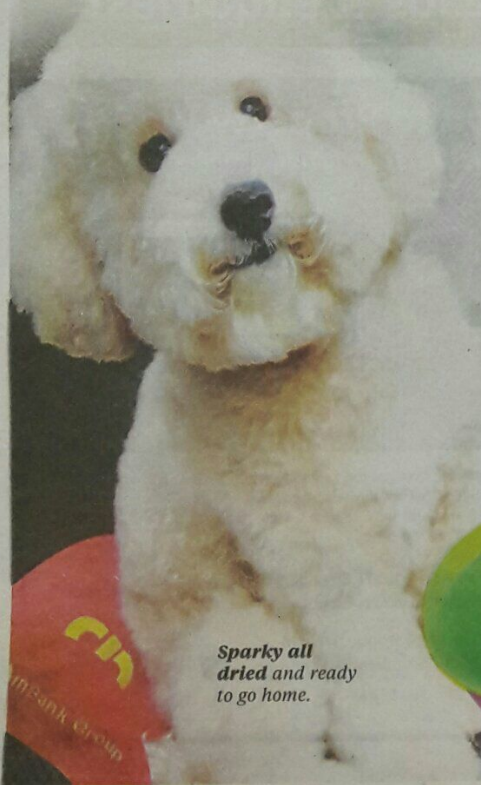
Sparky all dried and ready to go home.

So, are you ready for a day by the pool with your beloved pooch?