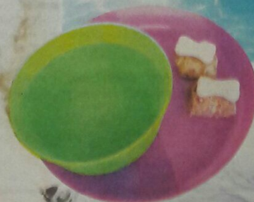
Doggy snacks with a bowl of water served after the swim.