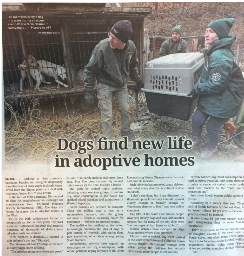
HSI members carry a dog in a crate during a rescue event after a farm closure in Namyangju.