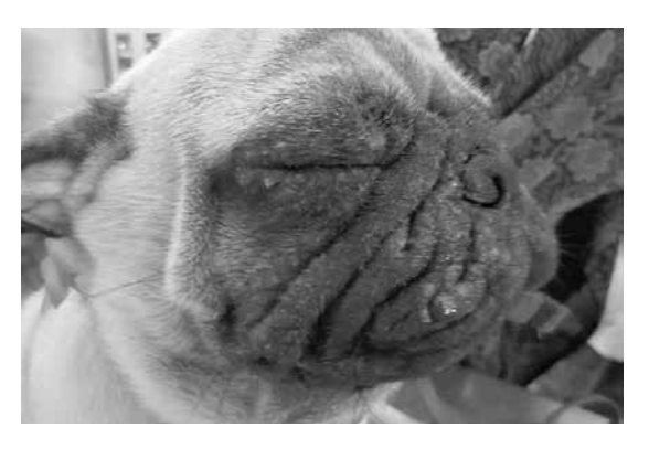
Figure 1. A pug with excess nasal fold

Among 83 corneas, 40 (35%) showed pigmentation in all the sectors with varying pigmentation score and mean pigment density. Pigmentation of medio-ventral quadrant of cornea was the most affected quadrant in the study. Detailed ophthalmic examination of the corneas and adnexa of the animals affected with corneal pigmentation revealed that 29 animals (53%) were affected with keratoconjunctivitis sicca (KCS), 13 animals (24%) with entropion, 6 animals (11%) with periorbital dermatitis and subsequent entropion, excess nasal fold in 5 (9%) animals (Figure 1) and trichiasis in 2 (4%) animals. The mean value of random blood sugar (RBS) was 107.84 \pm 0.99 which was in normal range. 5 animals (8%) showed RBS values above normal range suggestive of hyperglycemia and diabetes (mean value 220 \pm 0.76 ). The mean