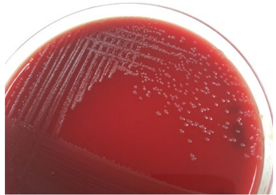
Figure 1. P. multocida serogroup F on 5% ox blood agar.

the presumption that P. multocida serogroup F (Figure 2) as only positive controls for P. multocida serogroup A, B and D were available. Thus, amplification of the repeated analysis by using single specific primers of